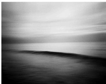
© Stephan Vanfleteren – Golf, Noordzee | Courtesy Gallery FIFTY ONE